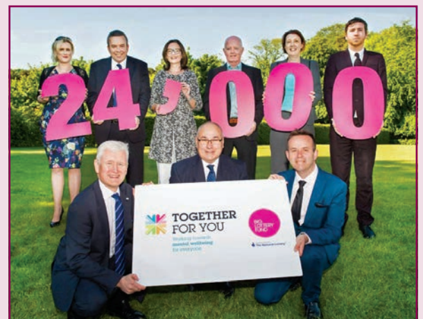
Together For You Partners celebrate reaching over 24,000 individuals since October 2013