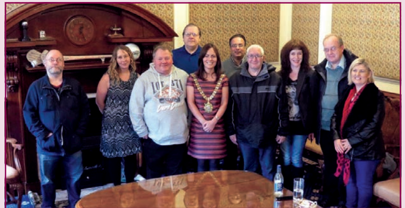
Staff and Service Users enjoying a cuppa with Lord Mayor of Belfast Nichola Mallon