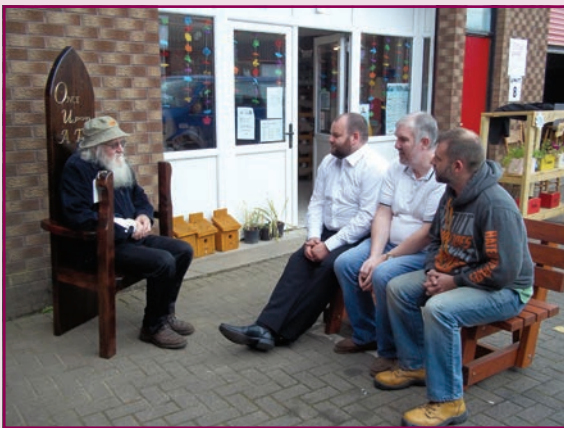
MindWise Magherafelt Beardy Bunch raised an amazing £1,400 for their service